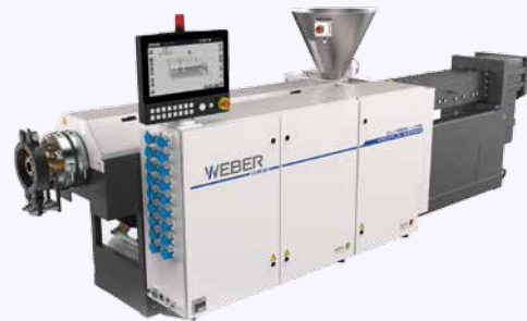
Classis Line Profile Series for extrusion of window profiles