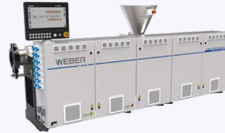
High Performance NE 40D Series for extrusion of polyolefin pipes Ø 10 - 1000 mm