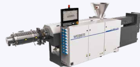
Classis Line Pipe Series for extrusion of PVC pipes Ø 5 - 800 mm