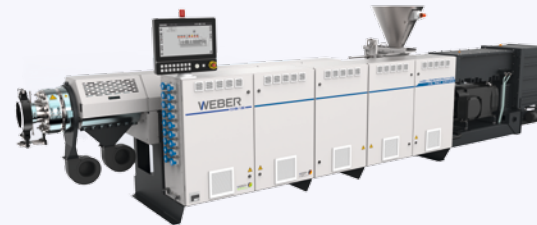
High Performance DS 32D Series for extrusion of PVC pipes Ø 5 - 800 mm