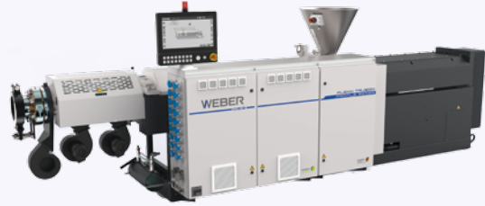
FlexXtrusion Profile Series for extrusion of window profiles